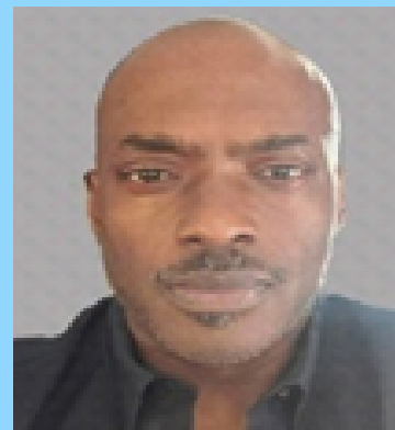
Trenton Hughes Intermediate Clerk Juvenile Records