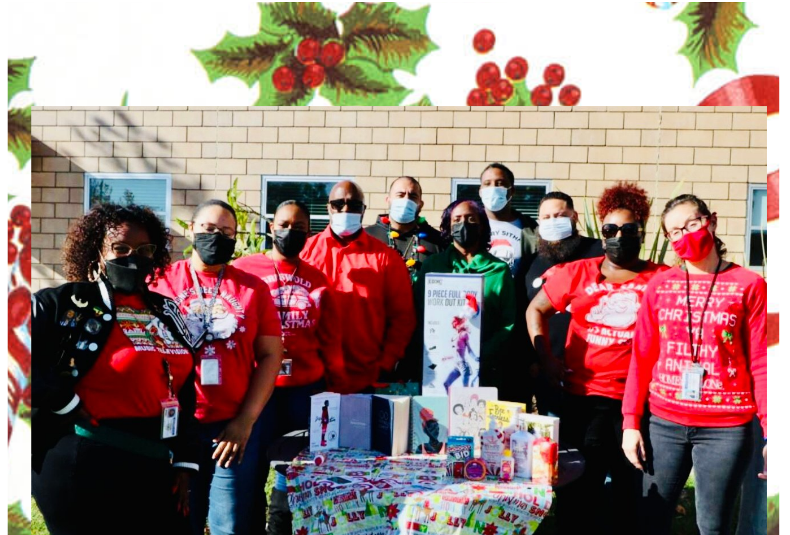
Centinela Area Office's PRCS Unit donating gift cards and toys to "United Friends of the Children Non-Profit"