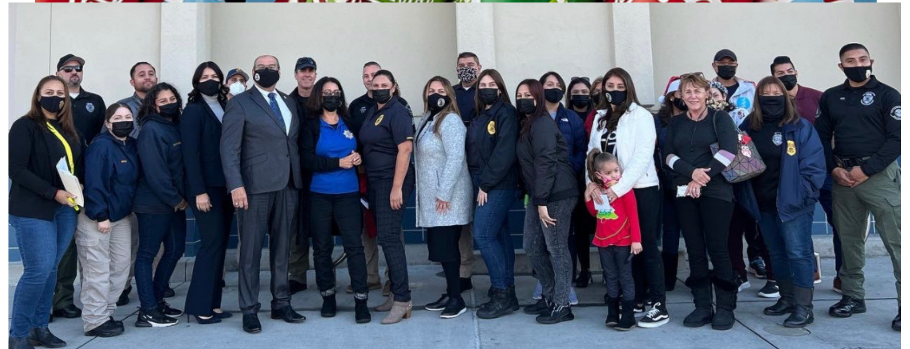
Deputies volunteers at "Holiday Heroes" in Baldwin Park