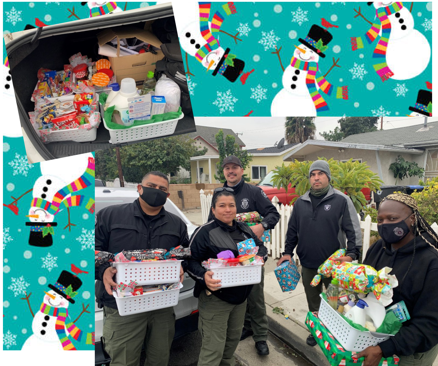
SEO adopts a family