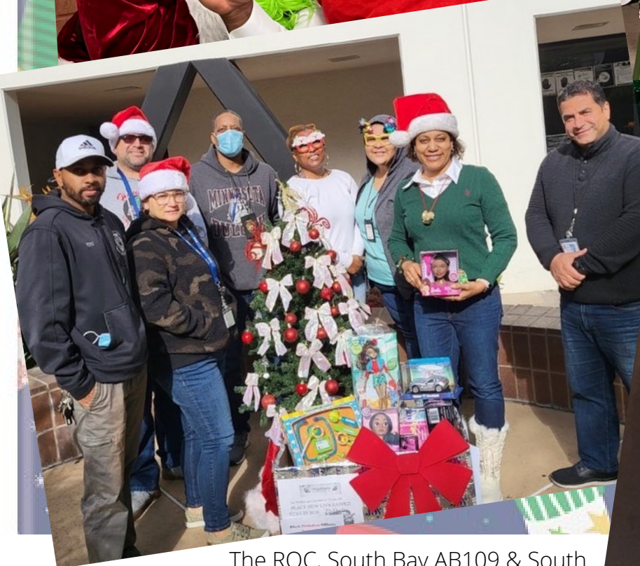
The ROC, South Bay AB109 & South Central Area Office Toy Drive