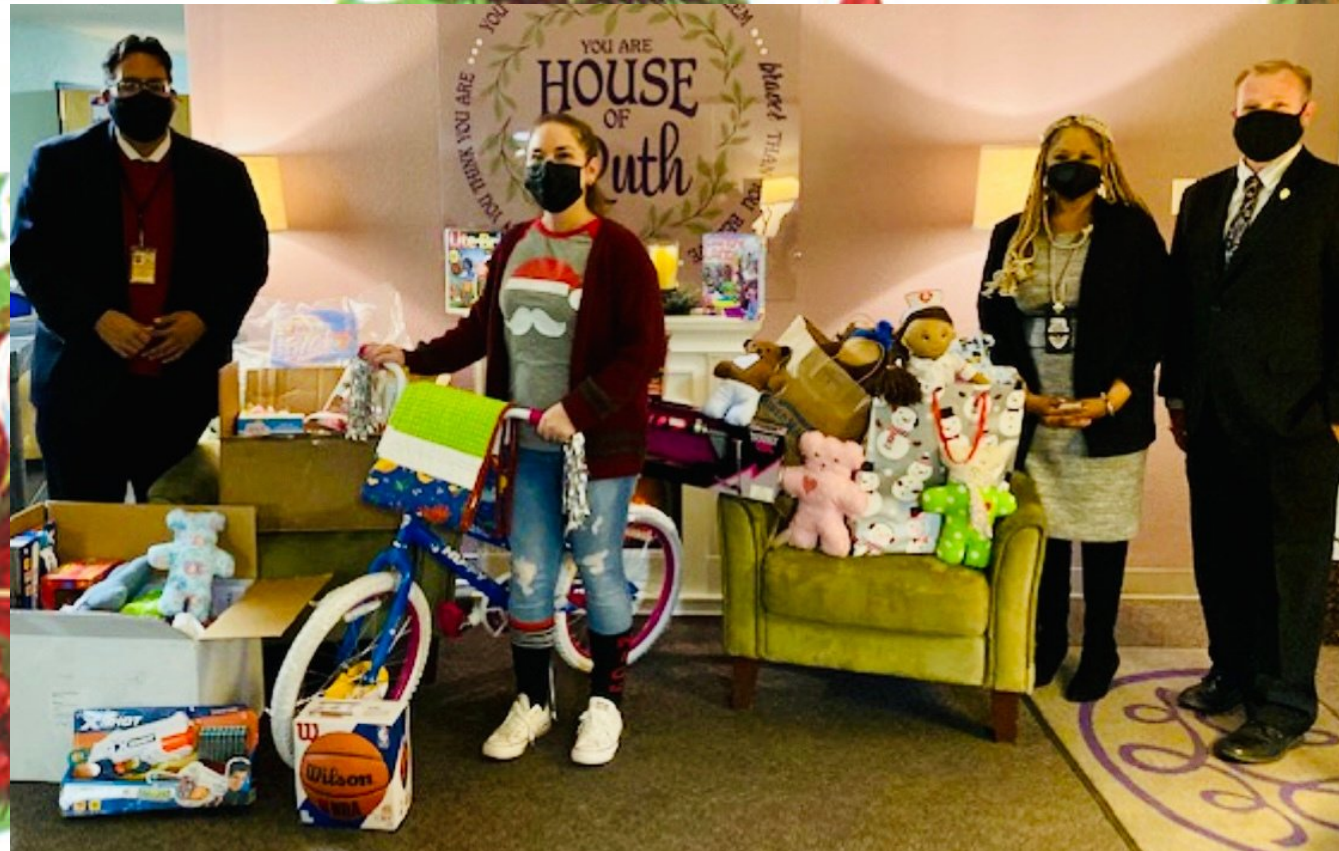
CORE Bureau donates toys to a Domestic Violence Shelter