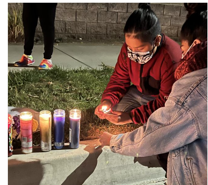
Mourners lighting candles