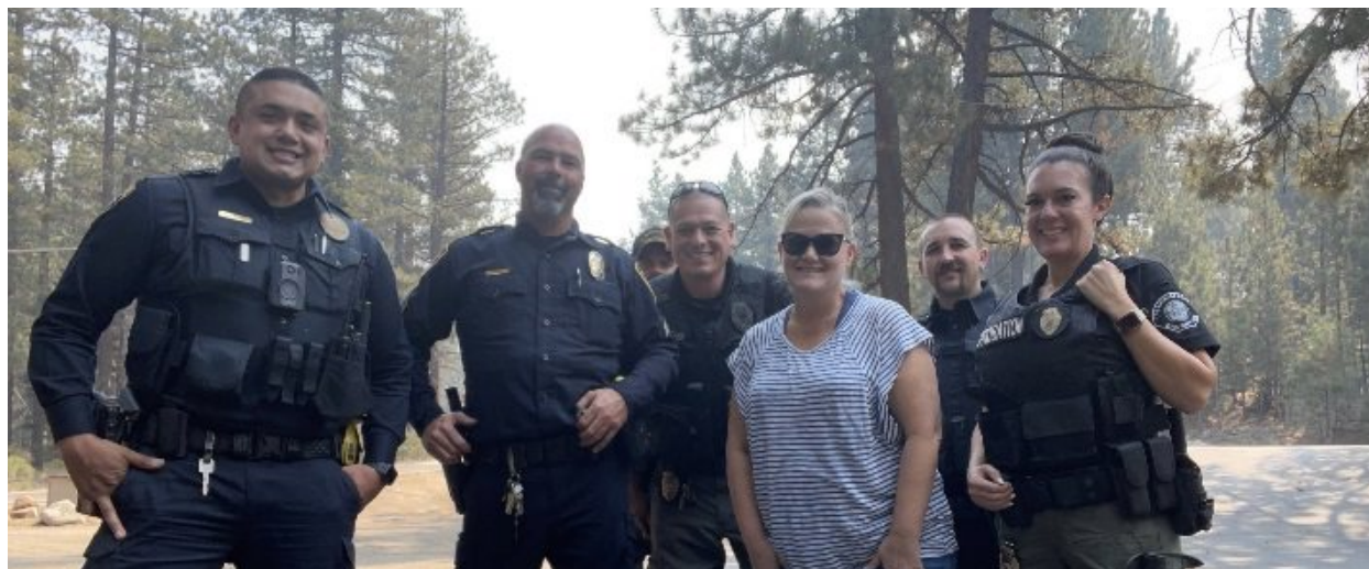
Proud first responders pose with a grateful resident