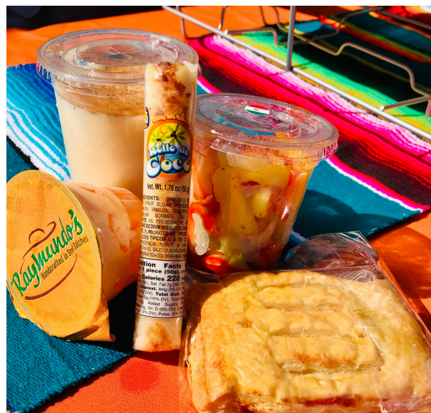
Tasting Table Giveaways