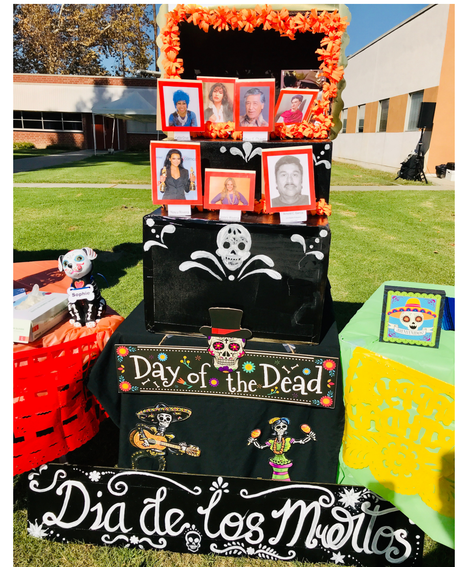
Día de los Muertos exhibit