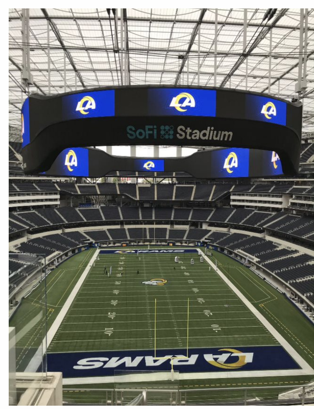
SoFi Stadium, home of the Los Angeles Rams (and Chargers).

After the stadium tour guide educated all in attendance on some exciting specifications of the unique venue, they were also granted access to the stadium suites. "This is great! I've never experienced anything like this. It's a new stadium, and I like it," a youth shared.