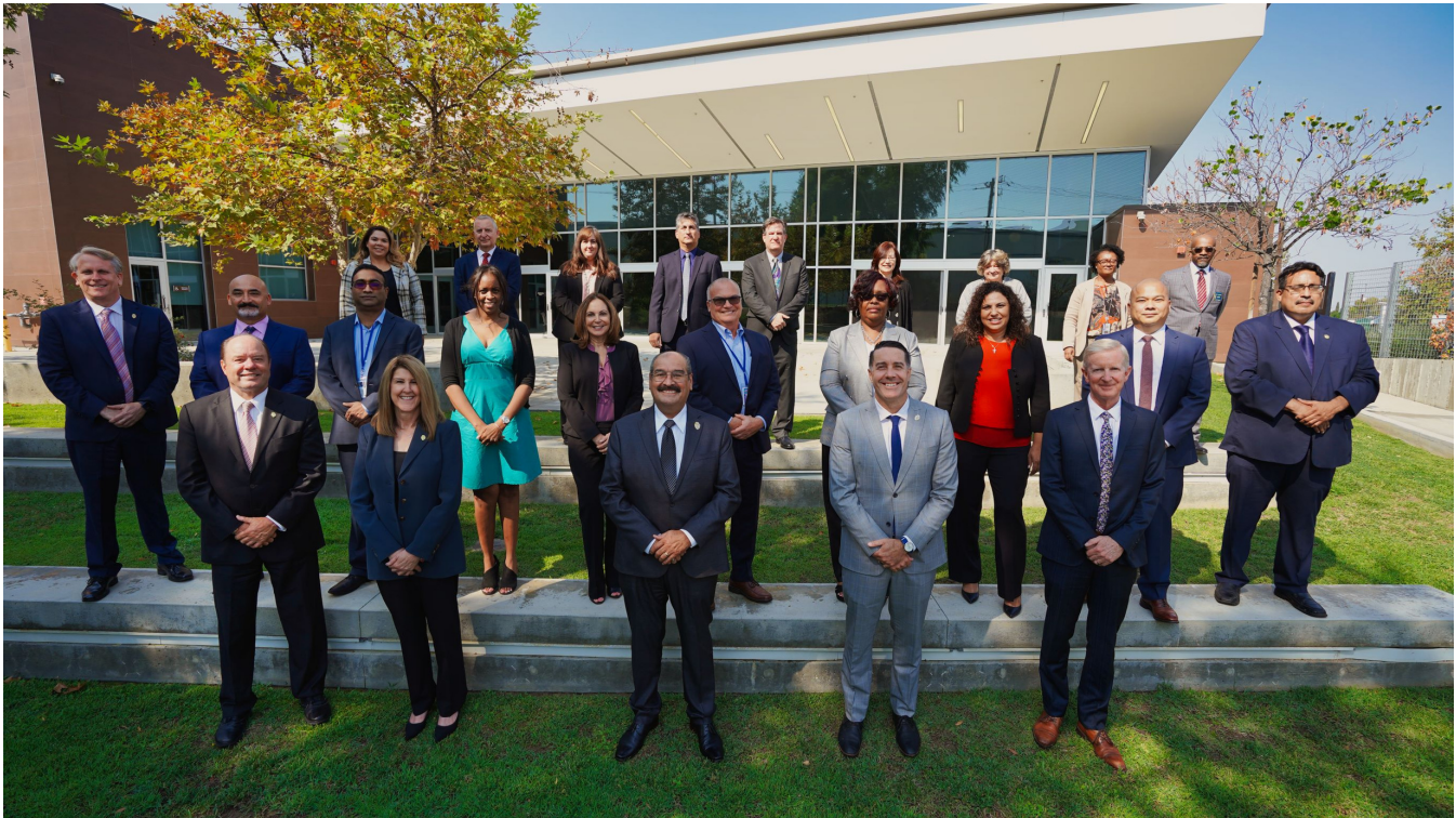
Executive Leadership Team

As the Department progresses with the times and strives to answer the call and develop a newly imagined juvenile probation system, we are excited to work under the direction of these three visionaries and great leaders. On behalf of your Los Angeles County Probation Department family, congratulations to each of you. With your guidance, we look forward to continuing our efforts to change lives and positively impact the communities of Los Angeles County.