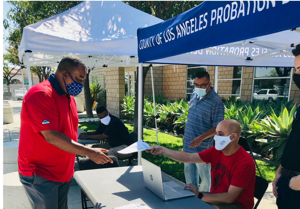
LA County Probation in the community

During the event, the three collaborators were available to provide community members, including the homeless population, information on eligibility and the process of obtaining their stimulus payments even if they didn't have a job, a permanent address, previous tax returns filed, or a bank account. Thus, the event was informative and educational for all those in attendance.