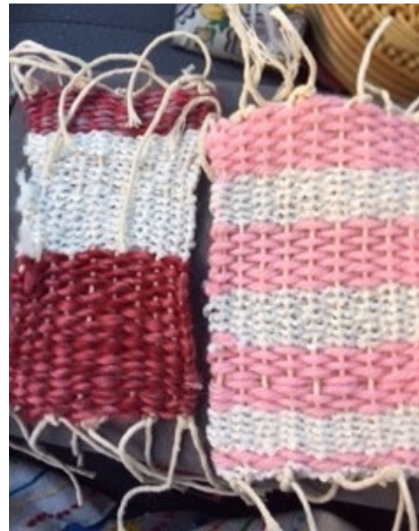
Weaving Art from a youth and Forever Friend