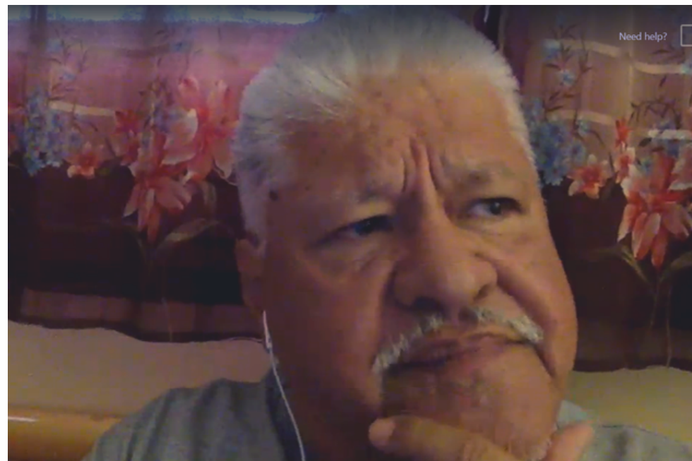
Keynote speaker, author Luis J. Rodriguez