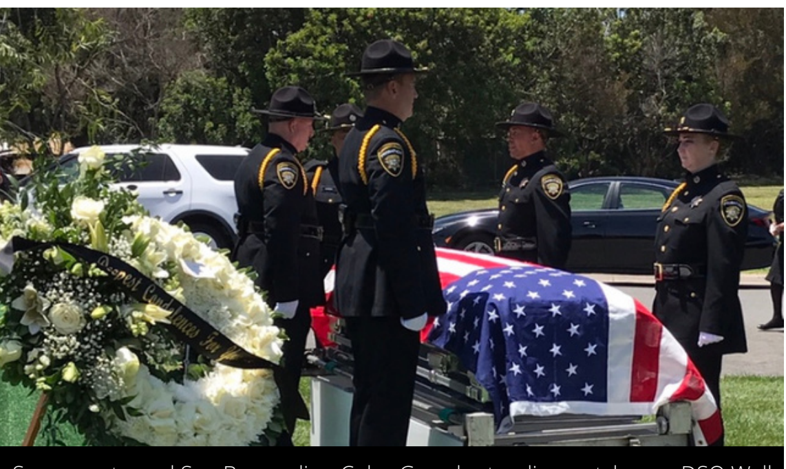
Sacramento and San Bernardino Color Guards standing watch over DSO Wall