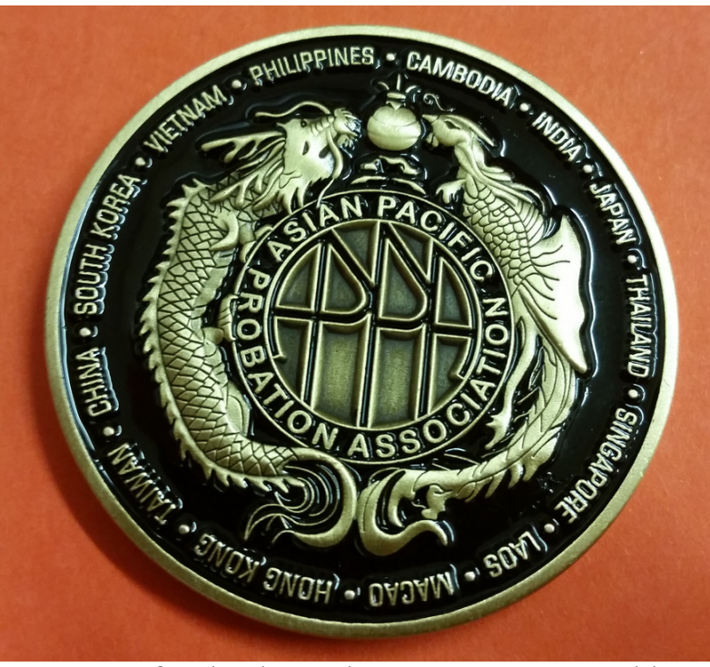
Asian Pacific Islander Probation Association Emblem

Asian Pacific American Heritage Month recognizes and celebrates the remarkable achievements and the rich cultures of the Asian Pacific Islander (API) American to the history, culture, and achievement of the United States. The Asian American Probation Association (APPA) has been leading the way in promoting API contributions in government, specifically in law enforcement and corrections, since 1992. APPA has been actively promoting and bridging young professionals through networking, mentoring, and professional growth in preparing future leaders for the challenges in this new age full of demands. Many prominent representatives and professionals from the Federal, State and local level of government have been partnering with APPA in this effort to foster the growth of the next generation of leaders, and at the same time to celebrate the rich, diverse Asian cultures with strengthened solidarity among the Asian American community.