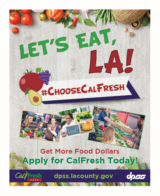
Graphic A (General Population) - Let's Eat LA! <u>Download</u>

These web graphics* can be used to enhance your social media posts and capture the attention of your audiences to inform them about the CalFresh Program in Los Angeles County.