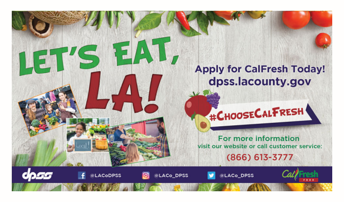
Web Slider A (General Population) - Let's Eat LA! <u>Download</u>

These CalFresh Lobby TV Monitor Graphics can be downloaded and displayed on any TV, especially those found in lobbies or areas where your customers are waiting to be serviced. These graphics inform viewers about the CalFresh Program in Los Angeles County, and the various social media sites they can access to learn more about the program, and obtain the latest information.