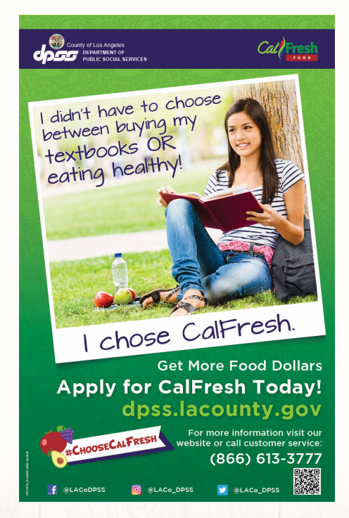
Poster C (Student) - I Chose CalFresh.