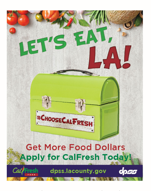
Graphic B (General Population) - Let's Eat LA! <u>Download</u>