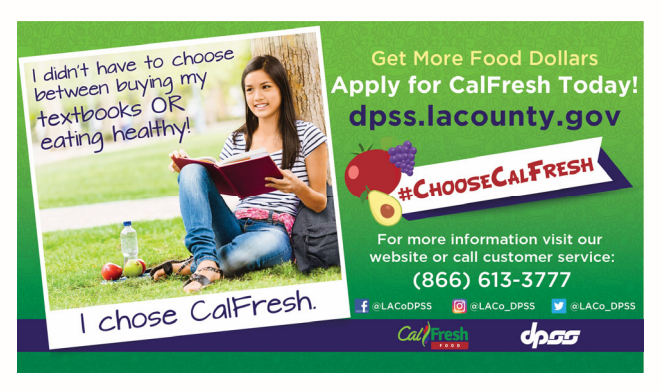
Web Slider B (Student) - I Chose CalFresh.