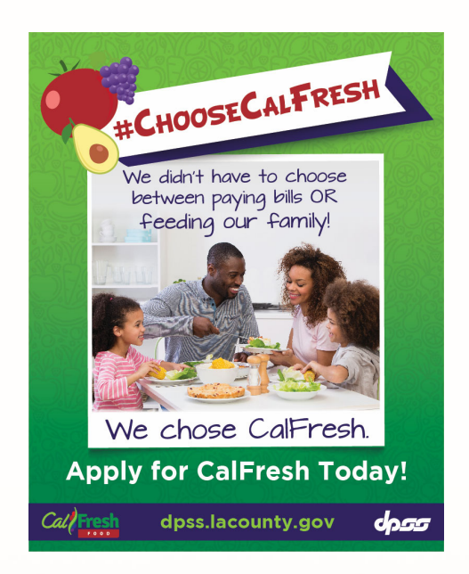
Graphic D (Family) - We Chose CalFresh. <u>Download</u>