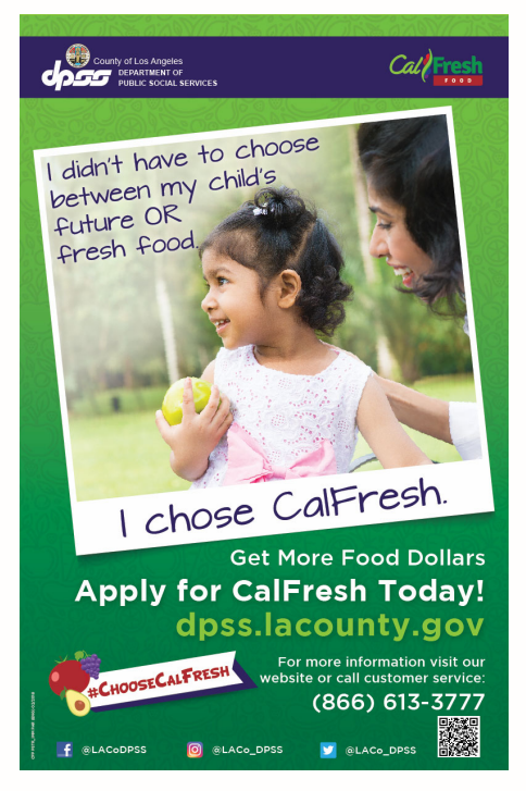
Poster E (Family) - I Chose CalFresh. <u>Download</u>