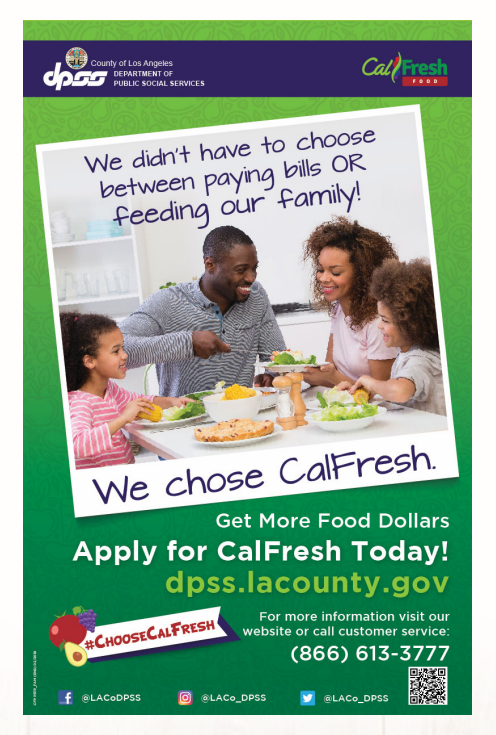
Poster D (Family) - We Chose CalFresh.