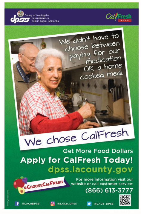
Poster G (Elderly) - We Chose CalFresh. <u>Download</u>