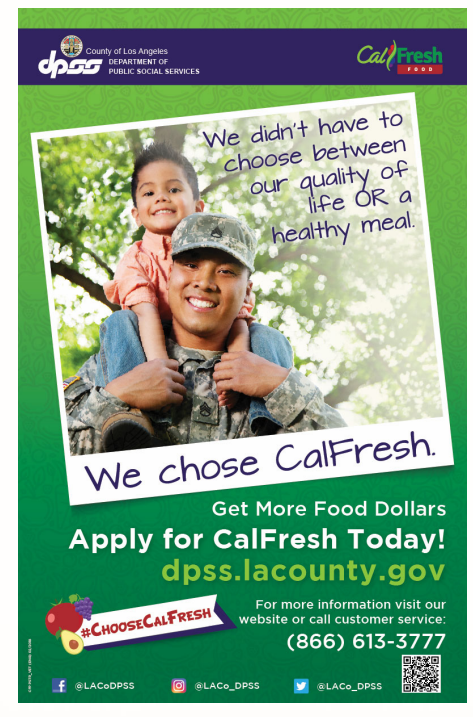
Poster H (Veteran) - We Chose CalFresh. <u>Download</u>