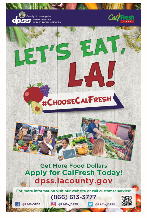
Poster A (General Population) - Let's Eat LA! <u>Download</u>

These printable 11" x 17" posters can be displayed throughout your organization where customers are primarily serviced; to educate them about the CalFresh Program in Los Angeles County, and the various social media accounts they can access to obtain more information from DPSS.