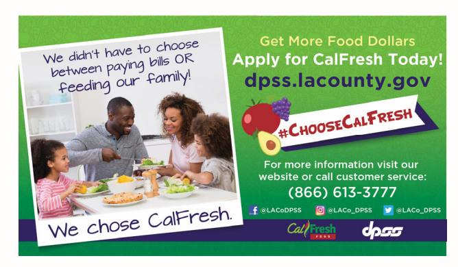
Web Slider C (Family) - We Chose CalFresh.