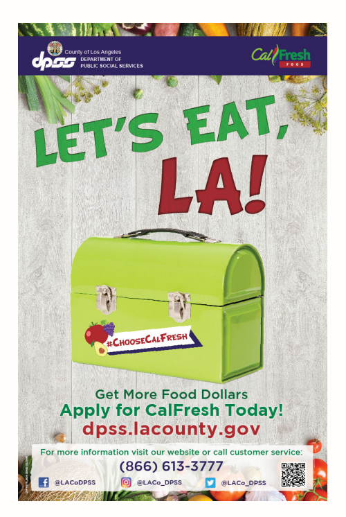
Poster B (General Population) - Let's Eat LA! <u>Download</u>