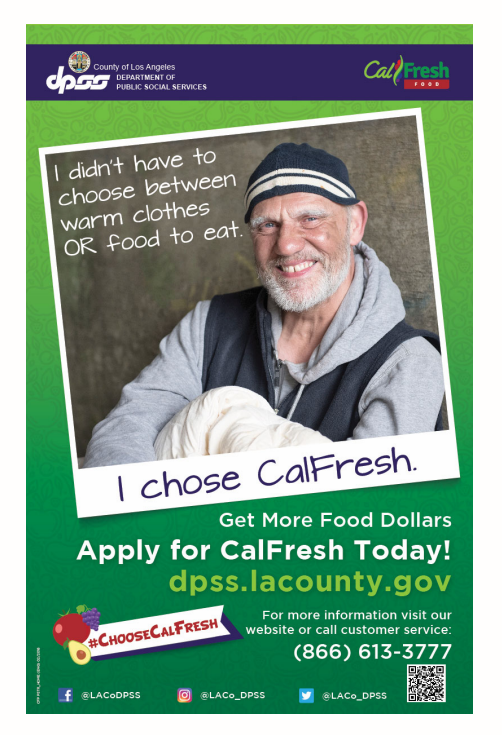
Poster F (Homeless) - I Chose CalFresh. <u>Download</u>