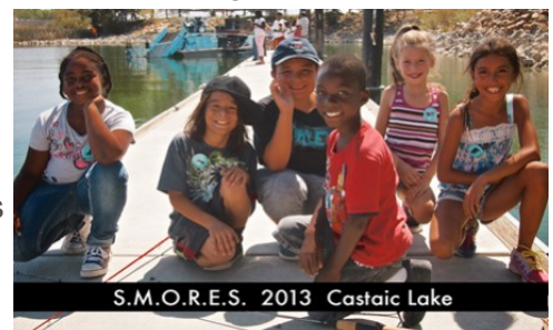
S.M.O.R.E.S. 2013 Castaic Lake

Next spring, the program comes to Kenneth Hahn State Recreation Area and Whittier Narrows Recreation Area – where, by exposing them to biodiversity-rich natural areas in Los Angeles County, the Department looks to continue helping young people develop positive habits that foster a sense of environmental stewardship in future generations.