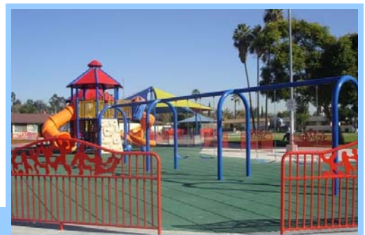
Sunshine Park Playground

In recent months, Sunshine Park has gone through an impressive transformation. New recreational facilities consist of a new playground, a splash pad with shade canopy, and a new exercise area for adults. Additions to the landscape and improved maintenance have played a large role in the appearance of the park. Additional trees and shrubs make for a greener, friendlier looking park. Sunshine Park also experiences a great amount of community involvement. Despite recent cutbacks, teens and other volunteers pitch in and help to maintain the regular recreation programs that the community cherishes.