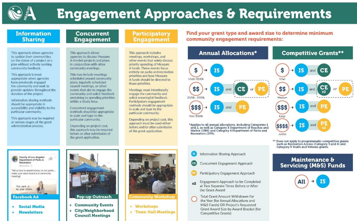
Figure 3-3: Engagement Approaches and Requirements