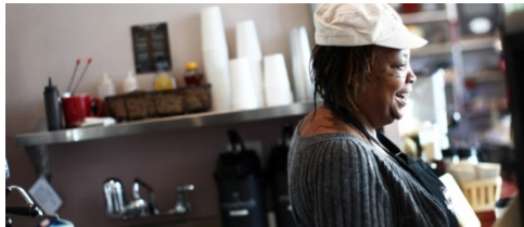
Café & Gift Boutique