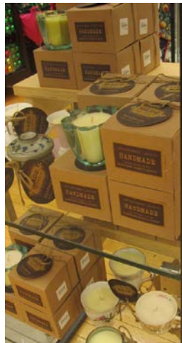
h a n d M A D E