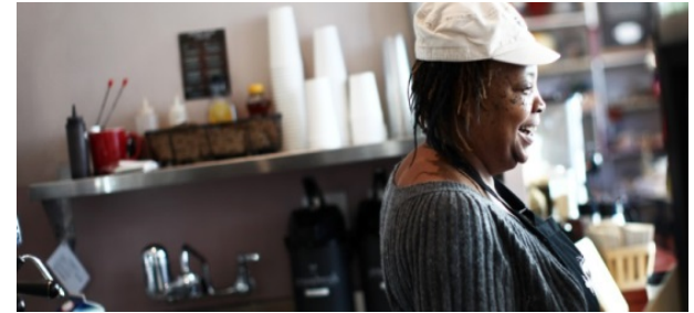
Café & Gift Boutique