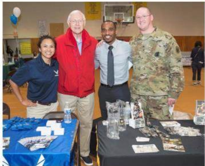
United States Air Force and United States Army recruiters