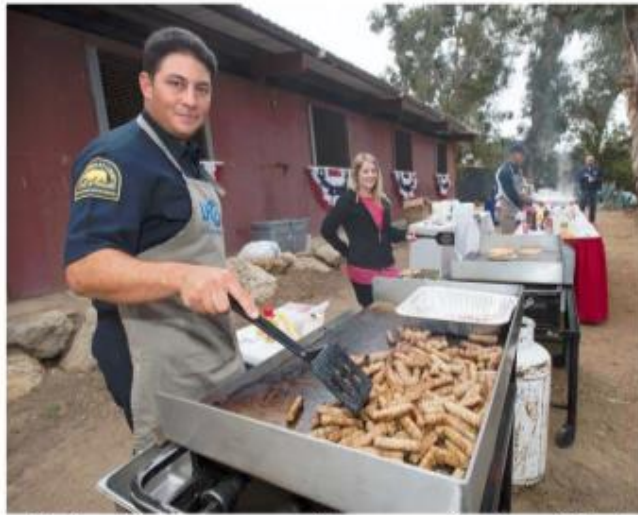
Volunteers prepare the pancake breakfast