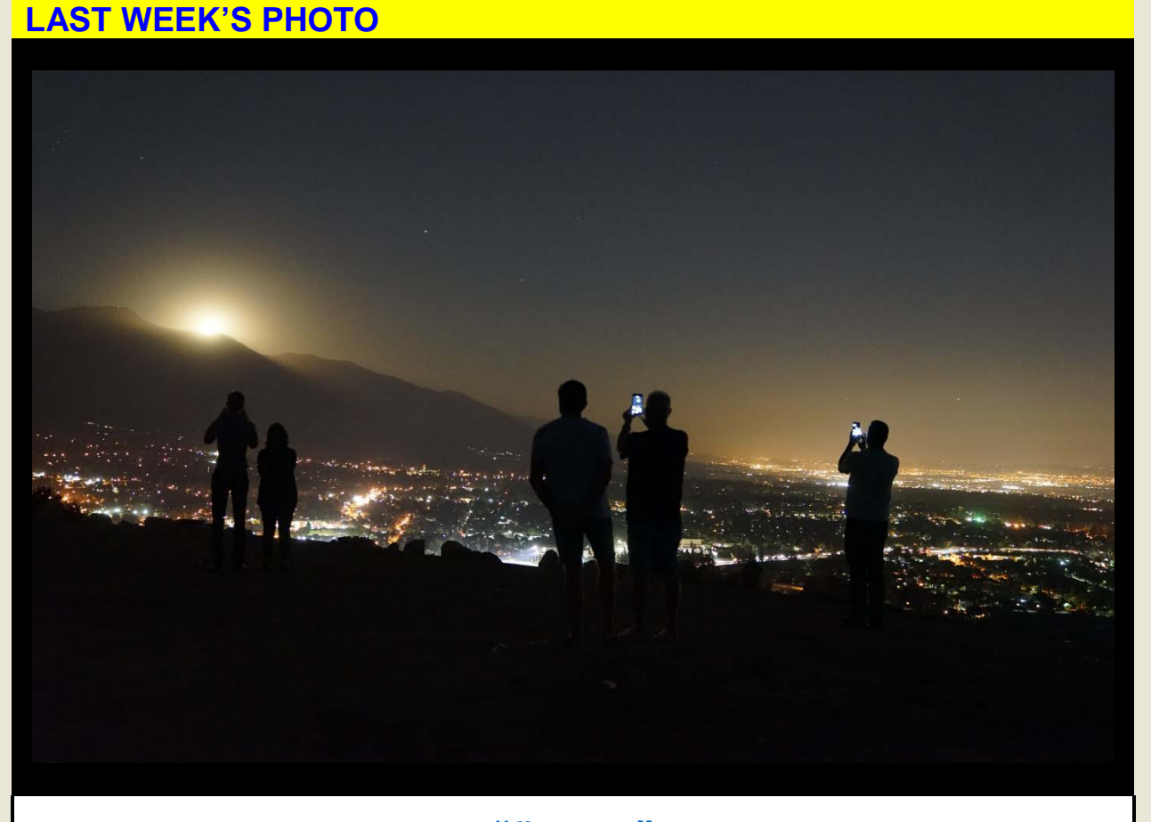
"#super" Caption submitted by Anonymous

For photo and caption submissions, please e-mail: pio@dmh.lacounty.gov.