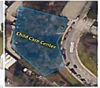
LAC+USC child care center Guardería de Niños de LAC + USC