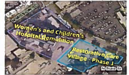
Women's and Children's Hospital Demolition 1240 North Mission Road