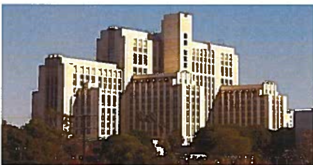
General Hospital Feasibility Study General Hospital Re-use feasibility Study Estudio de Viabilidad de Reutilización del Hospital General