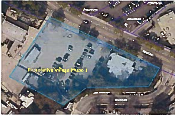
Restorative Care Village – Phase 1 1744 North Mission Road

Recuperative Care Center (96 beds) and Residential Treatment Center (64 beds)