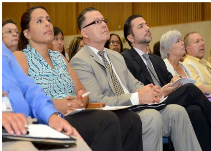
County employees listen to representatives at the Health Care Reform training held at the Kenneth Hahn Hall of Administration.

With its full implementation expected in 2014, the Affordable Care Act (ACA), also known as Health Care Reform (HCR), will significantly increase the eligible Medi-Cal population in Los Angeles County.