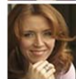
SAMANTHA DUNN Author and Feature Writer for The Orange County Register