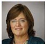
DR. LUCILE M. JONES Seismologist US Geological Survey