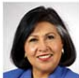
GLORIA MOLINA Board of Supervisors County of Los Angeles

Pasadena Convention Center 300 E Green St Pasadena, CA 91101