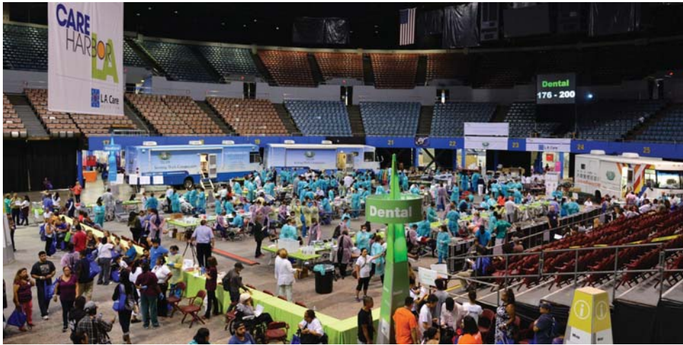
DPSS assists with the 7th annual Care Harbor event that brings thousands of residents together in order to receive free services such as medical, dental, vision, and preventive care.

Over the years, the clinic has been held at the Great Western Forum in Inglewood, the Pyramid on the campus of California State University, Long Beach, and more recently, the historic Los Angeles Memorial Sports Arena. DPSS, Public Health, Health Services, Mental Health and Chief Executive Office helped disseminate information about the clinic’s new location at The Reef.