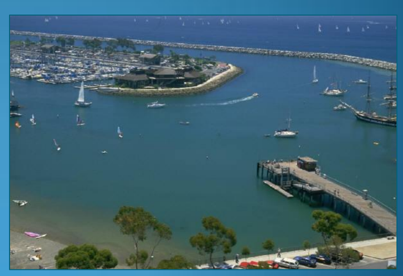
Copyright © 2012 Recreational Boaters of California

Hosted by Dana Point Yacht Club February 29, 2012