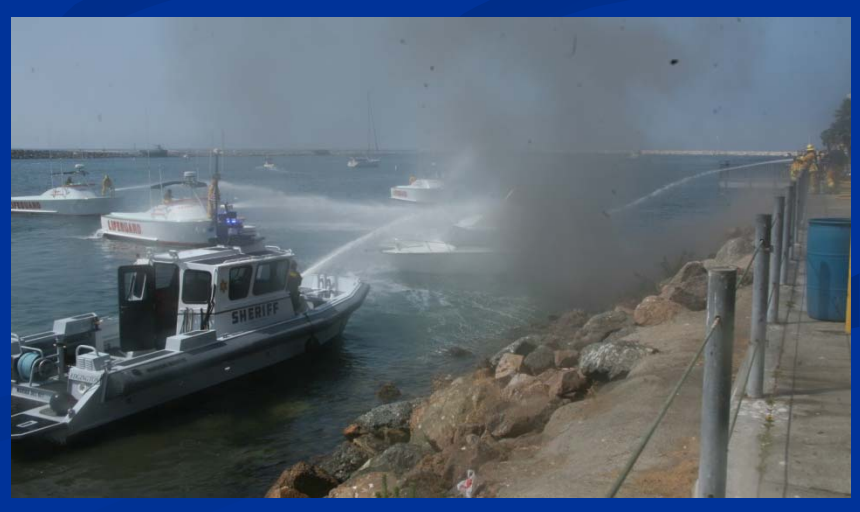
Boat on fire near the Marina entrance

*Source: L.A. County Sheriffs Department – Marine Operations