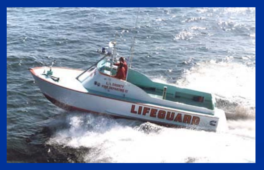
Los Angeles County Lifeguard Baywatch