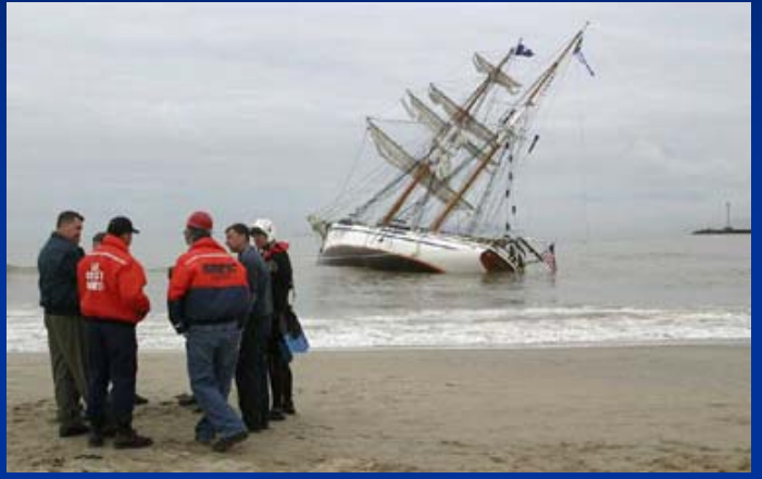
Aground vessel near the Marina entrance