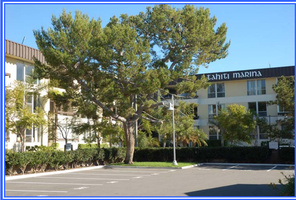
Parcel 7 Before

Tahiti Marina and Apartments (Parcel 7) located at 13700 Tahiti Way is currently in operation as a 149-unit apartment complex with a marina containing 233 slips. The proposed project includes major renovations to all 149 apartment units to include upgrades to all unit interiors, common areas, parking areas, and lobby. The marina will be replaced within 12 years of the completion of construction of the landside improvements. It is anticipated that construction will commence in the 3 rd quarter of 2011.