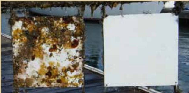
Testing alternative hull paints on panels (Port of San Diego)

The Port of San Diego analyzed 46 hull paints to determine how well they prevented fouling and their cost-effectiveness. The study found that alternative hull paints are environmentally-friendly, work well and can be cost effective over the long-term because they last longer than copper hull paints. The complete report is available at sandiegobaycopperreduction.org and you can also review the paint manufacturers' specifications for additional information.