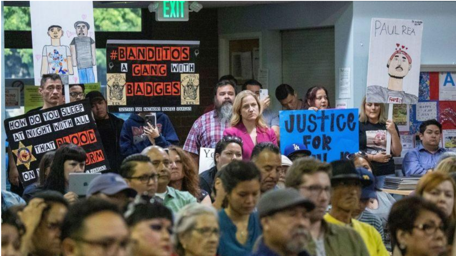
COC Town Hall in East L.A.