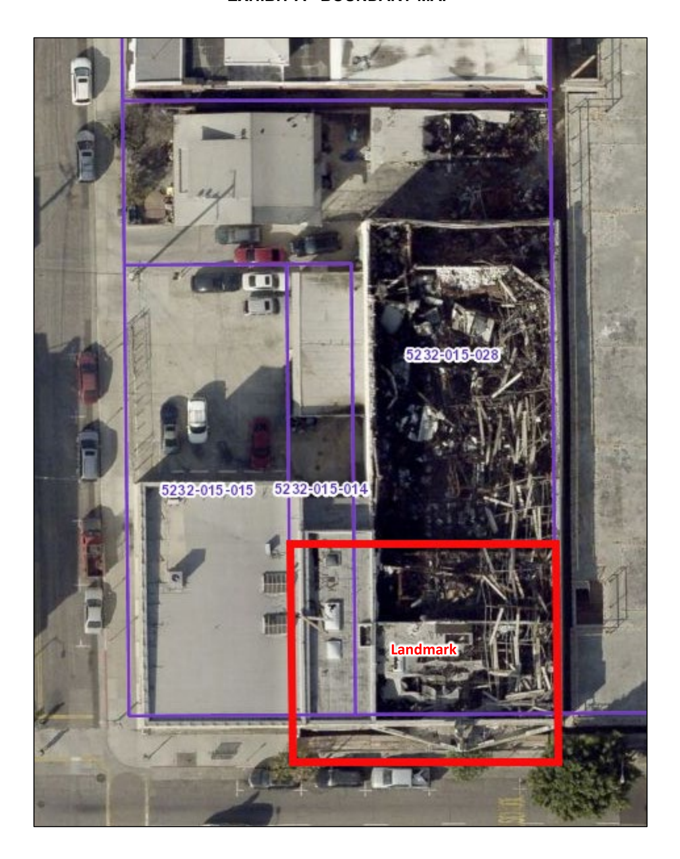
EXHIBIT A - BOUNDARY MAP