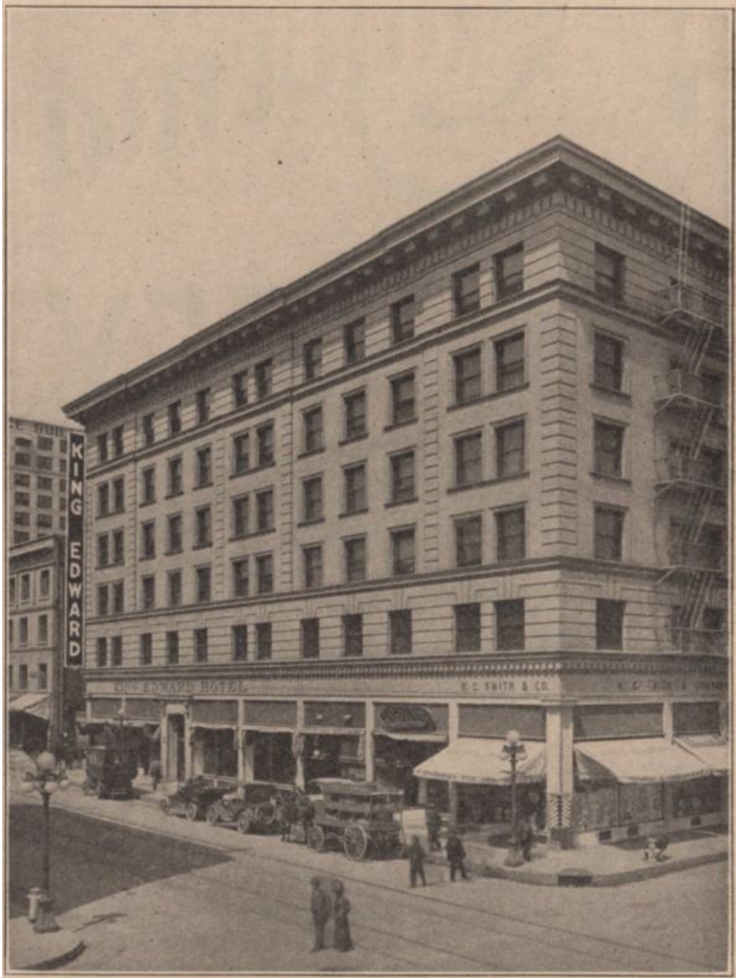
Figure 2 King Edward Hotel, circa 1908-1918