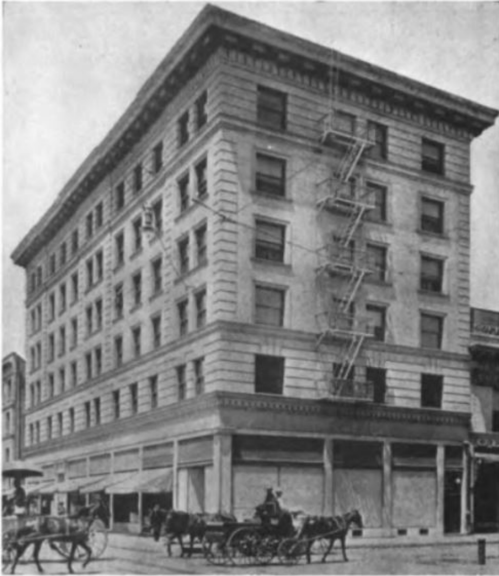
KING EDWARD HOTEL, FIFTH AT LOS ANGELES STREETS