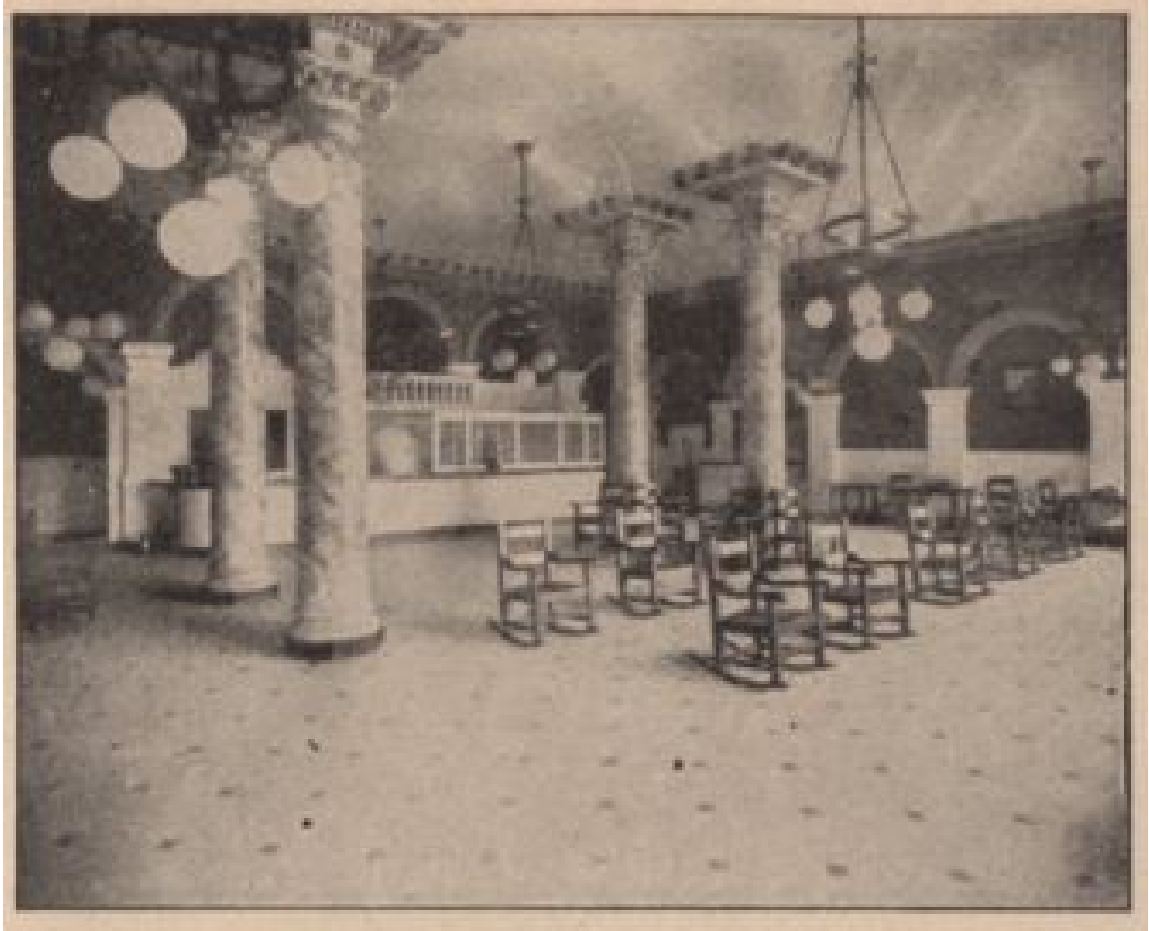
Figure 3 King Edward Hotel lobby, circa 1908-1918