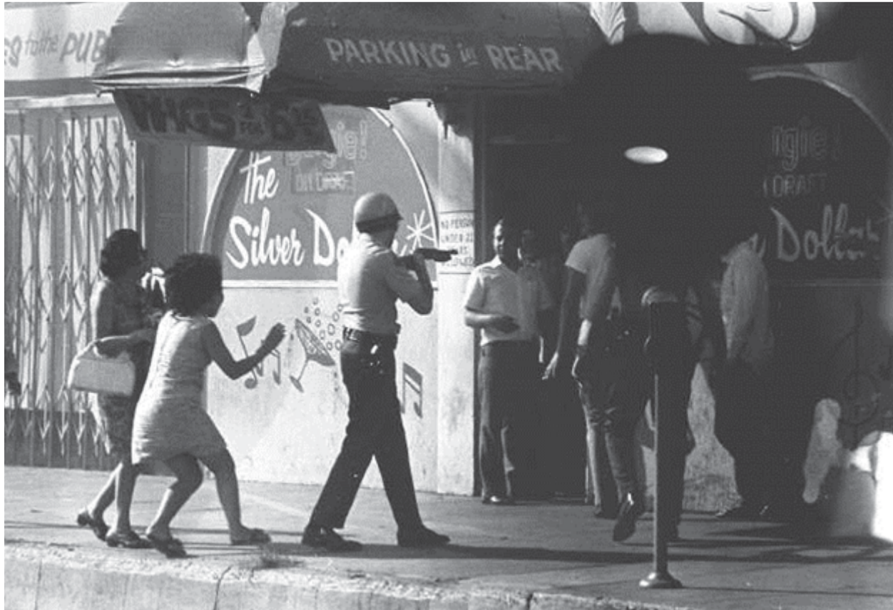
Figure 4. Sheriff's deputies outside the Silver Dollar Café, August 29, 1970. Photograph by Raul Ruiz from the cover of La Raza magazine. Reprinted in Mario T. Garcia, Ruben Salazar: Border Correspondent (Berkeley: University of California Press, 1995), Figure 16.