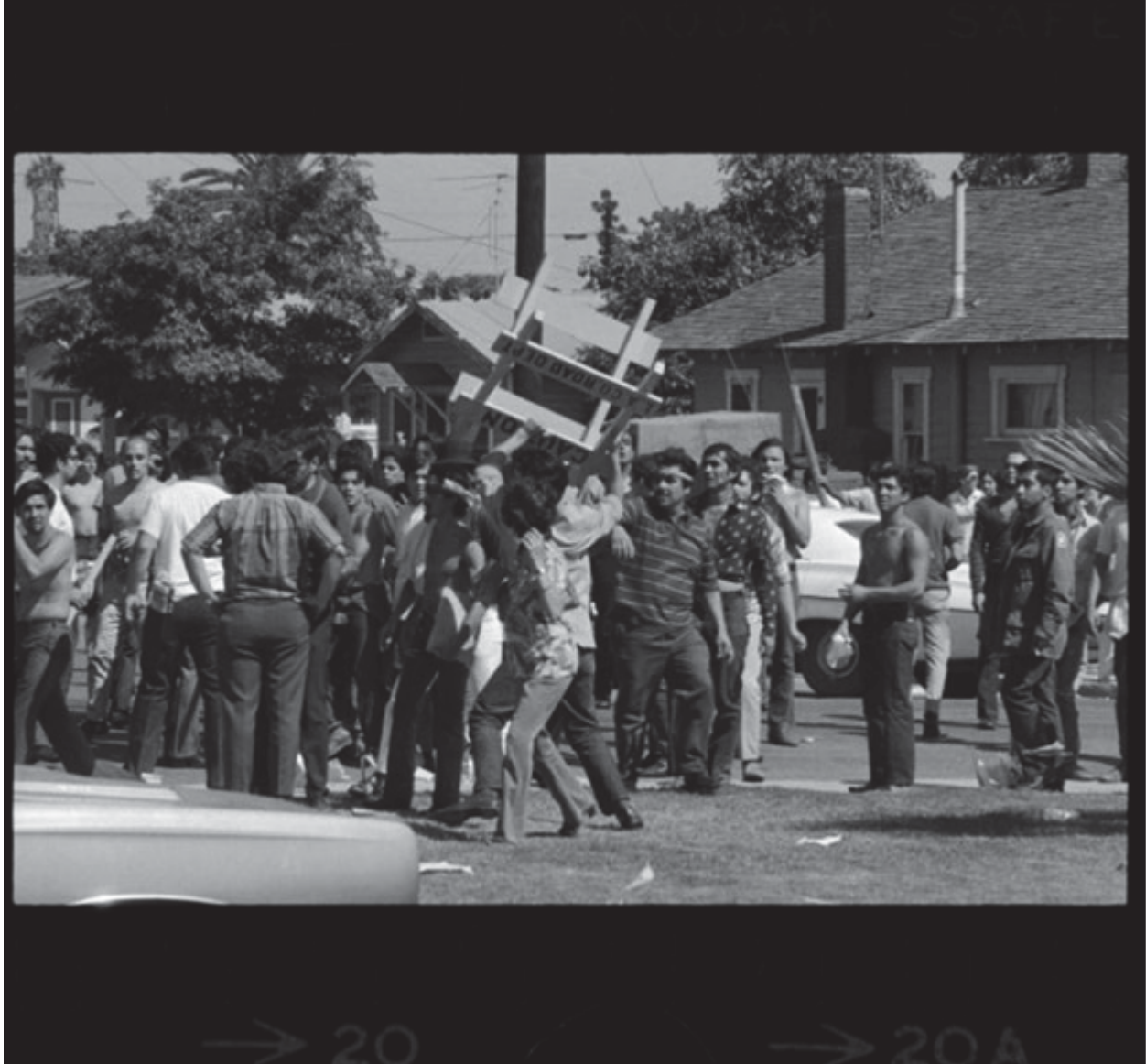
Figure 2. Antiwar demonstrators after the march, August 29, 1970.