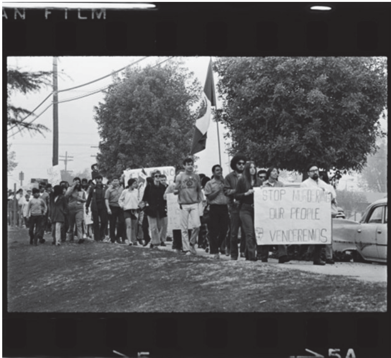
Figure 1. Antiwar demonstrators marching along route, August 29, 1970.