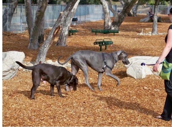
Photos from Crescenta Valley Dog Park

As a part of the development of the Crescenta Valley Dog Off-Leash Area, DPR also established departmental policy and procedures for dog off-leash areas (see Appendix B), which include guidelines on location selection, design features, maintenance and operational practices, and recommended enforcement.