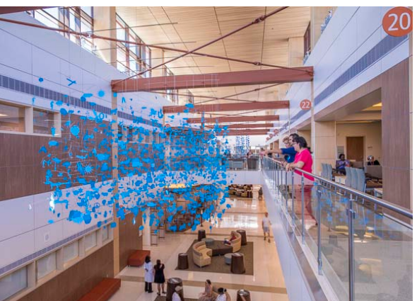
One Desert Sky by artist Brad Howe at the High Desert Regional Health Center.

cultural perceptions that influenced the final civic artwork. The free interactive activities also produced input that inspired artist Brad Howe's permanent artwork for the Health Center.