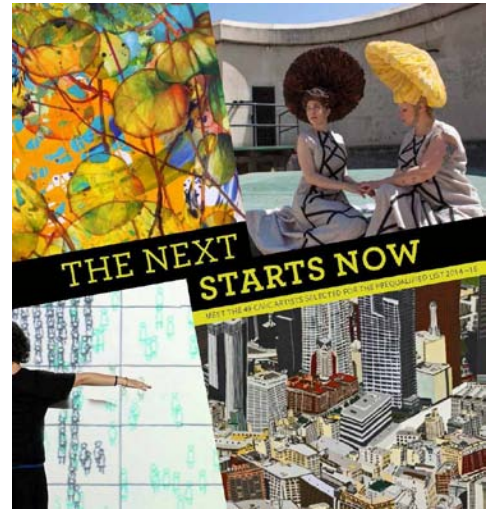
Catalog cover for the prequalified civic artists list.

Designed to enhance artist exposure in national markets and increase career sustainability, benefits are inclusion in a print and online catalog with a quick reference poster, extended artist profiles online, promotion in the journal Public Art Review and invitations to additional technical assistance workshops and networking opportunities. The Next Starts Now catalog featuring the artists is available for download at www.lacountyarts.org/thelist.