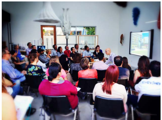
Open Office Hours at Cliff Garten Studio.

• The Civic Art Program hosted a networking session at the Ford Theatres in which participants had a chance to meet fellow members of the new Prequalified Civic Artists list and learn how to use that membership to their advantage.