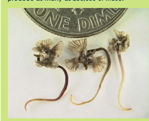
Tumbleweed seeds with the taproots uncoiled and ready to search for moisture. This process can take as little as 12 hours giving tumbleweeds a competitive advantage over many plants under low moisture conditions.