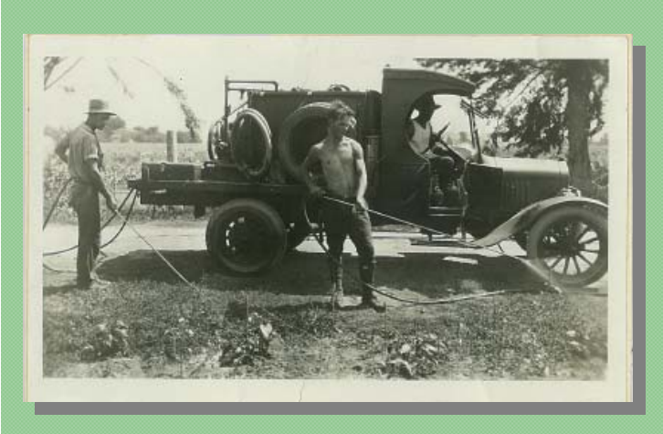
ACWM employees attempting to eradicate puncturevine in the San Fernando Valley in about 1938.

One of ACWM's missions has always been to attempt to control the spread of invasive weeds and in 1990, launched a major effort aimed at tumbleweeds. The initial plan to perform widespread tumbleweed burning proved highly controversial so ACWM reconsidered and discovered that carefully timed seasonal mowing not only destroyed existing tumbleweeds in place, but also the mulch left behind helped to prevent them from growing back the next year. Many areas of the Antelope Valley that were once almost a sea of tumbleweeds have experienced a type conversion or habitat change back to grassland with currently little or no tumbleweeds (see photos below). ACWM's fight with tumbleweeds is not over yet, but the invasive plant has never again reached the levels experienced at the beginning of the program.