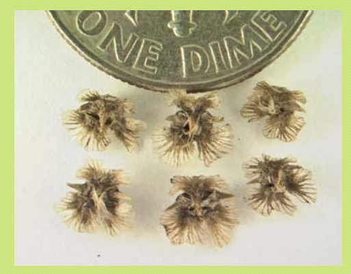
Tumbleweed seeds. A large plant can produce as many as 200,000 of these!