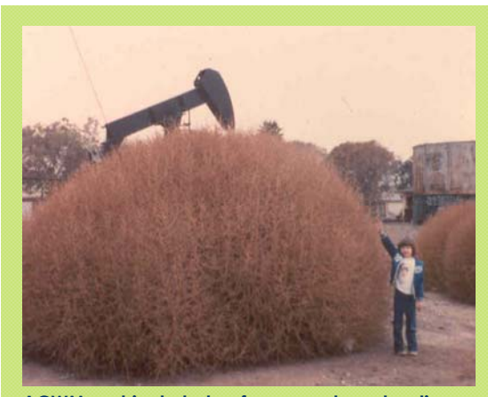
ACWM archival photo of a young boy standing next to a very large tumbleweed at an unknown location.

The following guidelines are specific to tumbleweeds. Please click on the following link for general weed abatement information related to the <a href="Weed Abatement Program">Weed Abatement Program</a>.