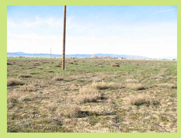
ACWM would not require removal of the tumbleweeds scattered across the property above if it remained in this condition.