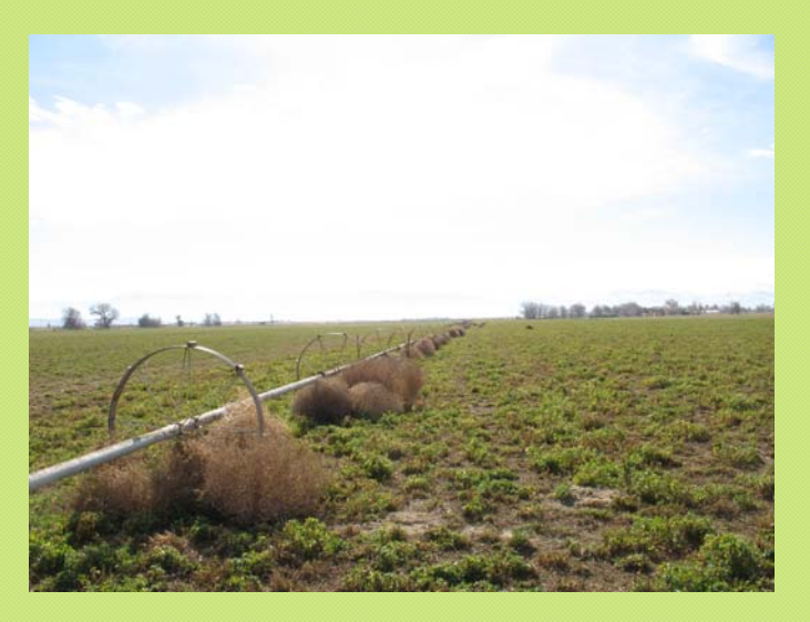
Tumbleweeds can pile up on automated irrigation equipment, such as the one shown in this photo, causing damage to the irrigation equipment.