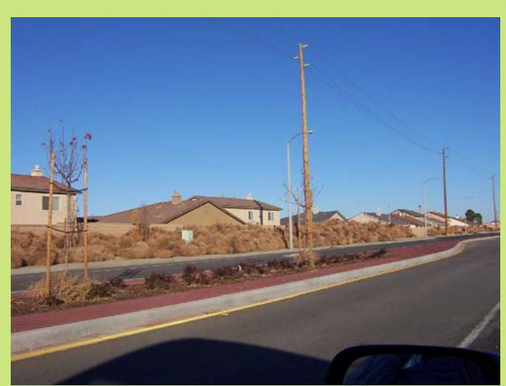
The photo above taken in December of 2006 shows the wind borne result of an expanse of tumbleweeds being blown off of an adjacent property and across the boulevard near the intersection of Avenue K and 60th Street West in Lancaster. The tumbleweeds piled along and over the block wall of the neighboring residential development.