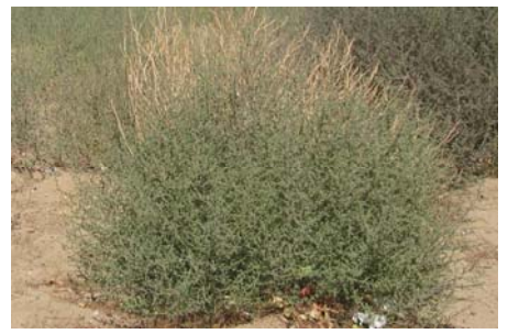
Russian thistle is commonly referred to as tumbleweed.

The climate, geography, periodic high winds and other factors make the Antelope Valley area of Los Angeles County vulnerable to the growth and spread of tumbleweeds. Fortunately, the destructive and nuisance potential of tumbleweeds has diminished over the last 20 years as a result of a cooperative effort of many Antelope Valley property owners and the Los Angles County Department of Agricultural Commissioner/Weights and Measures (ACWM).