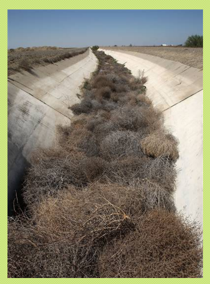
Tumbleweeds in an irrigation canal.