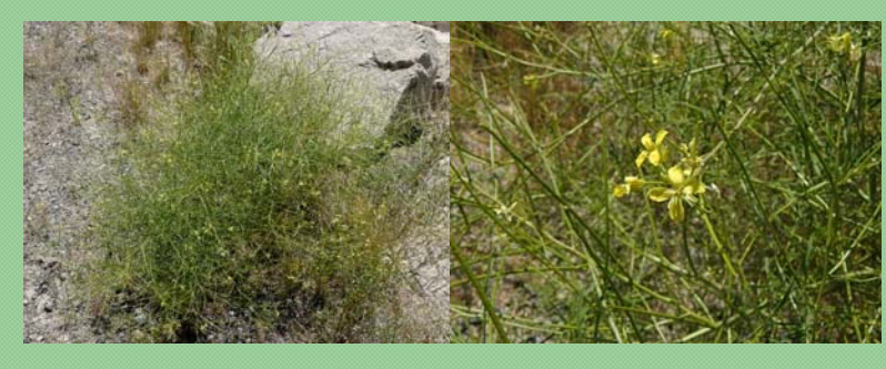
Tumble mustard (Sisymbrium altissimum)