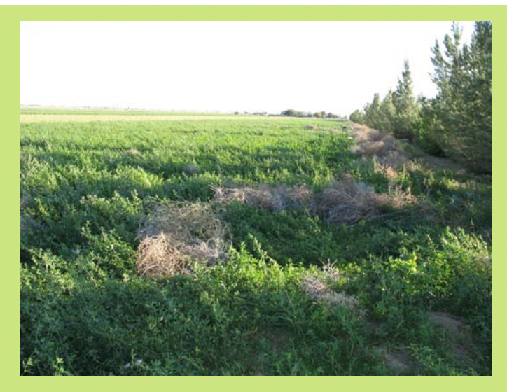
Tumbleweeds can blow into agricultural fields and take considerable effort to remove by hand.

Many individuals are allergic to the plant's pollen and sap causing dermatitis (skin rash) and rhinitis (runny nose). Their movement by the wind across roadways and busy intersections causes traffic hazards. Blown into waterways and canals they clog and disrupt what would otherwise be the free flow of water and a mass of tumbleweeds in a swimming pool are a minor disaster.