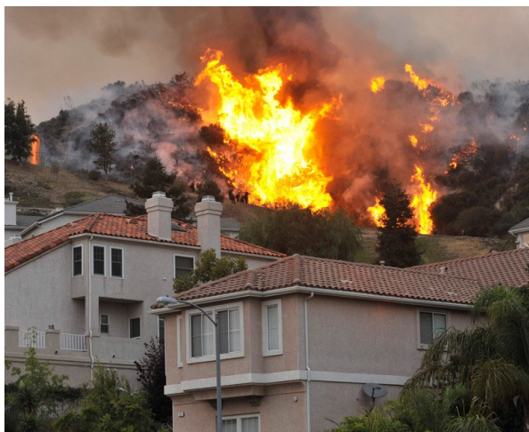
The Station Fire approaches homes in La Crescenta in September 2009

The size of each job (number of “units”) is predetermined by ACWM. The contractor must complete the packet of work within a specified timeframe, usually 14 days. All of the work is expected to be performed independently by the contractor and his or her staff without direct onsite