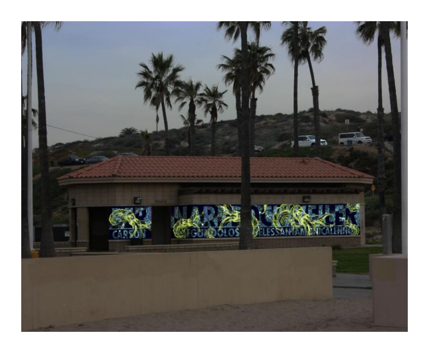
Night view of concept design with ammonite fossil painting.