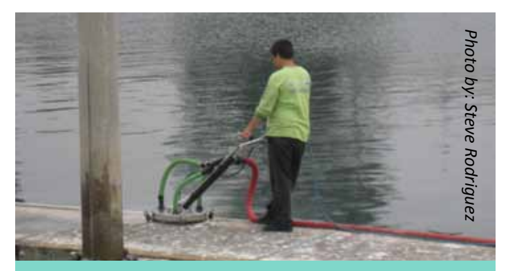
Green Clean Environmental hydro scrubbing the docks with a machine that collects and recycles wastewater through a quad filter system. Very little water is spilled into the harbor and the docks are scrubbed clean. This is the most effective and environmentally friendly method used by the harbor to remove bird droppings from docks.

Example of a cigarette butt receptacle installed throughout the harbor and beach area. Oceanside's cigarette butt recycling program is a very popular one with harbor visitors.