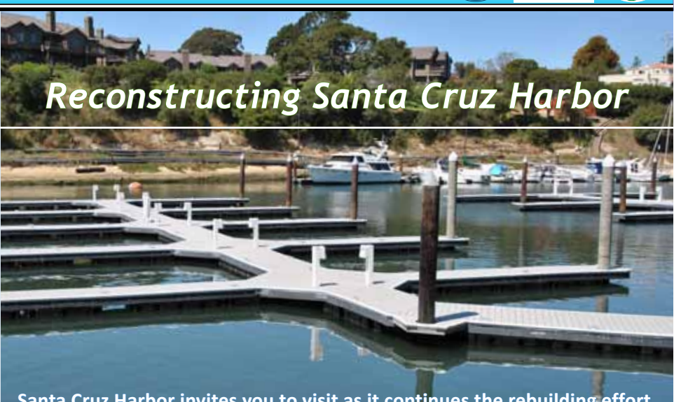
Santa Cruz Harbor invites you to visit as it continues the rebuilding effort. U-dock in Santa Cruz North harbor on the day of the ribbon-cutting ceremony, August 26, 2011

The harbor is divided by a bridge separating the south and north harbor areas. Initially, it appeared that the north harbor sustained the heaviest damage – one dock was completely destroyed, others were rendered unserviceable, and all docks had hazardous conditions including missing structural components and flotation. Numerous vessels sank. Electrical and water service were disrupted dockside. In the ensuing weeks, it became evident that the south harbor docks had also sustained significant, although less obvious, damage.