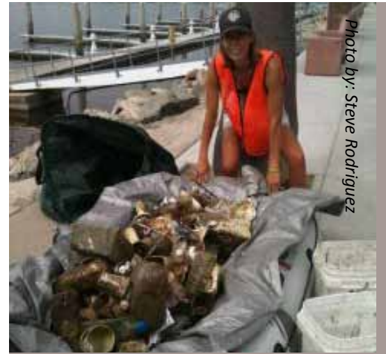
Trash Patrol picking up debirs around the harbor.